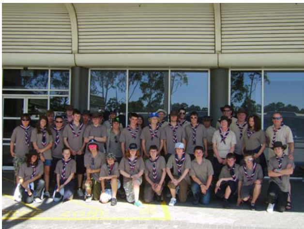
The UK contingent at Perth Airport

No doubt we will hear lots more about the exiting times at V2009.