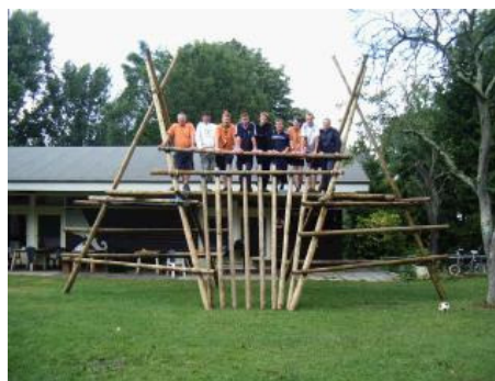
See the web site for all the pictures!

Cleaned the hut and set of to IJmuiden to get the ferry.